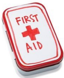
Altoid Mini First Aid Kits