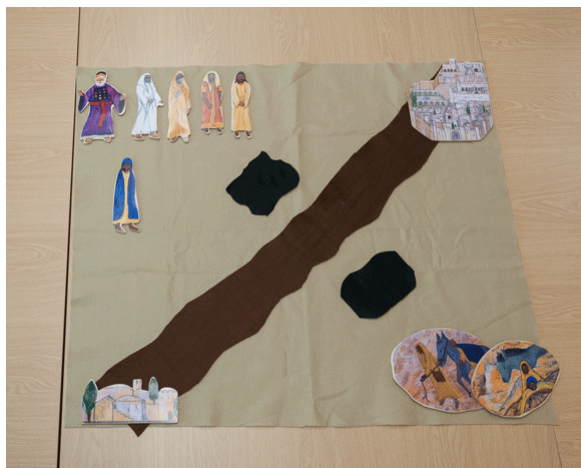
The Parable of the Good Samaritan