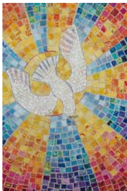
Holy Spirit Collage