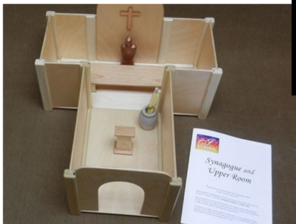
The Synagogue and the Upper Room