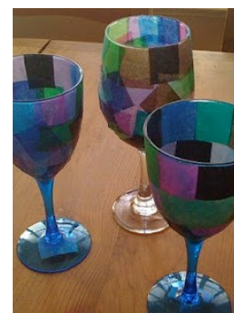
Paten & Chalice Making