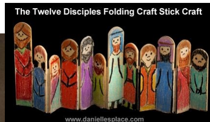
Jesus and the Twelve