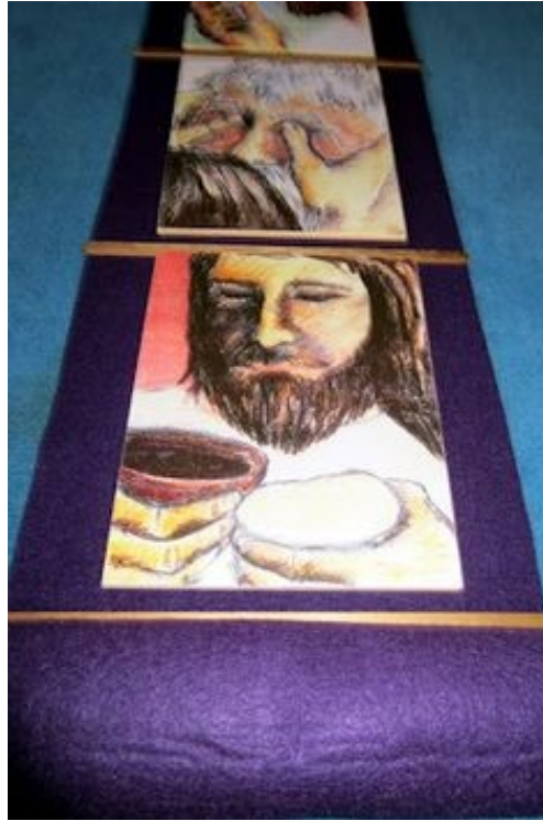
Faces of Easter Godly Play Story