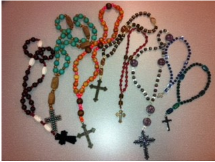
Making & Using Anglican/ Episcopal Prayer Beads