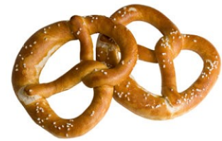
Lent & the Pretzel